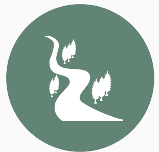
LANDSCAPED GARDENS & NATURE TRAIL