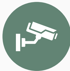
24 HOUR SECURITY PATROLS